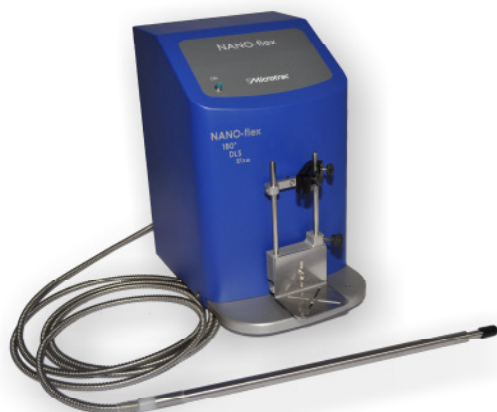
Figure 1: NANO-flex with measuring probe

At LLT (Chair for laser technology) in cooperation with Interactive Materials Research DWI (German institute for wool research at RWTH Aachen e.V.) a Nanotrac® size measurement instrument was purchased to track the synthesis of microgels by precipitation polymerisation in a reactor (Figure 2) at varying process conditions.